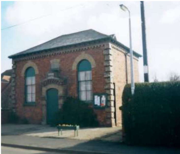
Wansford Methodist Hall, which opened in 1864.